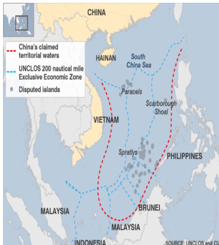
Figure 2: Disputed Islands

In the case of marine resource china, Vietnam, Malaysia, Taiwan, Brunei and Philippines claimed spartly islands in the South China Sea for the richness of hydrocarbon. Also Vietnam has claim parcel island which are occupied by china after mid – seventies. After that Vietnam and china engage another disputes to claims of Vung May, Song Hong, Phu Khanh basins. China wants to increase the demand level when India gets permit for the extension of 2 years oil and gas exploration in blocks 127 and 128 in the EEZ of Vietnam.