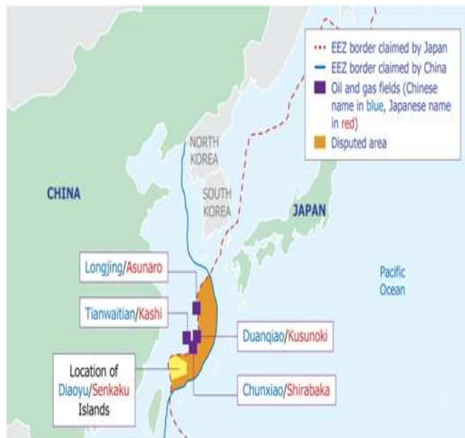
Figure 3: Disputed Sea Boundary and Islands-Japan

After the disputes of china- Vietnam, china continue engage to dispute with Japan. China and Japan have two disputes, therein one is related to ownership of islands and another is related to the demarcation of the sea boundary (Figure 3) between these two countries. The ownership of Daioyu/Shenkakuislands is the main issue between Japan and china because of rich fishing grounds and significant reserve of oil and gas fields.